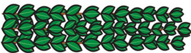
Hadas (myrtle) הדס