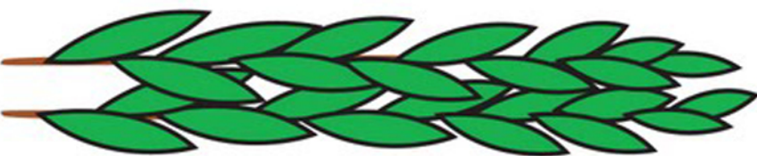
Arava (willow) ארבה