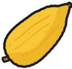
Eretz (citrus) אתרוג

The lulav , hadas , and arava are held together in the right hand; the spine of the lulav faces you, with two aravot on the left and three hadasim on the right. The eret is held in the left hand, touching the lulav . Before the blessing, the pittam of the eret is turned down; after the blessing and while waving the lulav , the pittam is turned up. Stand facing Jerusalem (east).